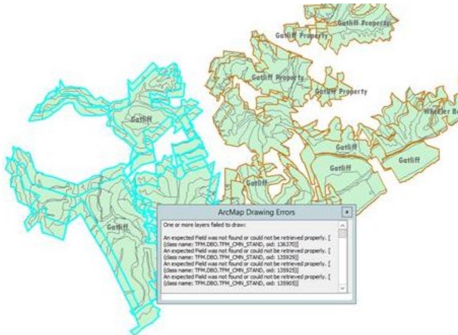
Fig 1 - Drawing error in LRM spatial view

If you're getting a drawing error in LRM spatial view, like the one in Figure 1, please follow these steps to fix it.